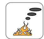
Low Toxicity EN 50305; NF X70-100/NF F63 808/TM1-04/BS 6853